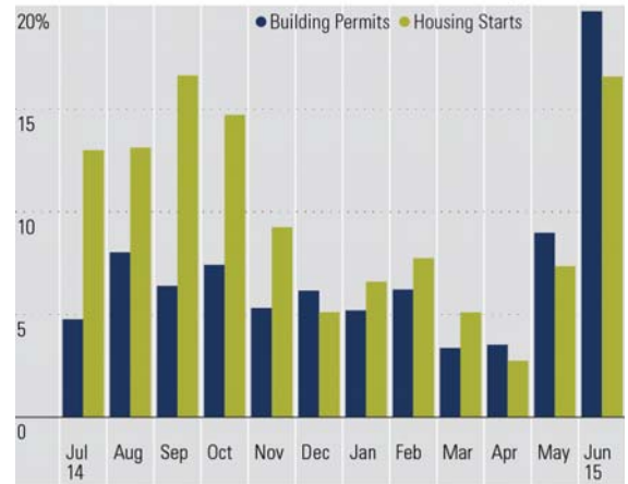
This article contains certain forward-looking statements which involve known and unknown risks, uncertainties, and other factors that may cause the actual results to differ materially from any future results expressed or implied by those projected statements. Past performance does not guarantee future results.